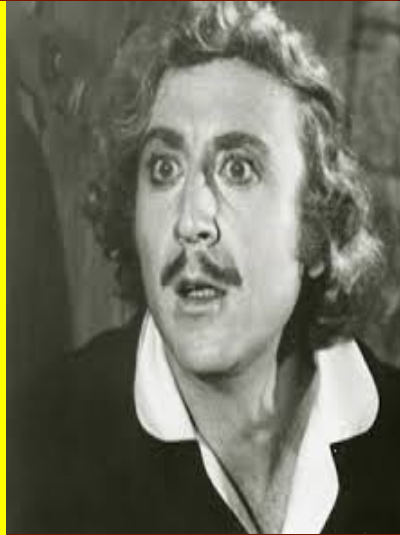
Gene Wilder in Young Frankenstein.