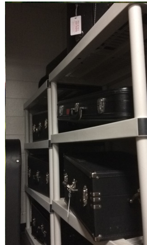
The instruments are waiting to get out of their cases