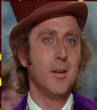
Wilder in his prime.