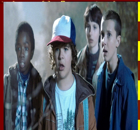
The cast on the show.

I couldn't take my eyes away from the screen. Check out this chill inducing show whenever you have a chance!!!